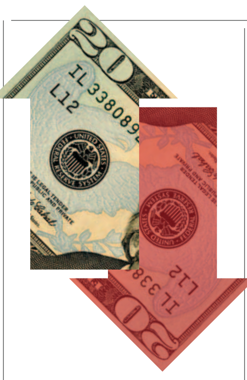
Cash Flow Stability: Those businesses that have performed well over the past two years have a decided advantage over businesses that haven't.

base, a deeper management bench, and more defensible market positions. Companies focused on consumer staples (food and beverage processing or distribution), utility-like services (waste disposal, energy, or communications), or healthcare remain quite attractive to lenders. For example, a beer distributor's favored status is a consequence of the rightful perception of stable demand and cash flow, and is manifested in higher permitted leverage and better-than-average pricing.